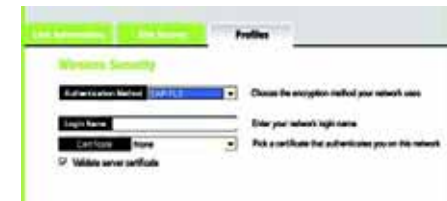
Figure 6-25: EAP-TLS Authentication

Click Next to continue or Back to return to the previous screen.